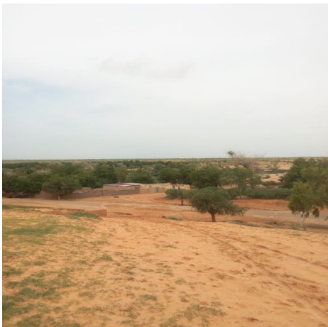
Photo d. shows deforestation near the lake which leads to the silting.