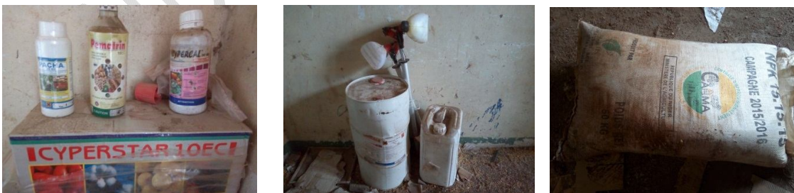
Photo B. Pesticides and fertilizer used by crop producers irrigate around Lake Guidimouni.