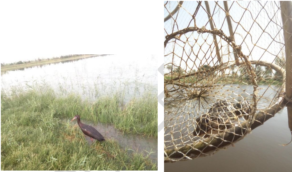
Photos A. Ciconia nigra and frog trapped by a poacher by the lake.

The study documents the following emerging menaces to the Lake Guidimouni which are: (i) overexploitation; (ii) microplastic pollution (Presence of the plastic waste in the lake); (iii) illegal poaching as documented by the photo (a) which shows the black stork ( Ciconia nigra ) and frog in the trap of illegal poacher as reported to us by the people we met during the field observation. (iii) salinization; (iv) chemical pollution caused by the use of chemicals (pesticide and chemical fertilizers) which come from irrigated farming activities near the lake (Photo b); (v) climate change represented by drought as reported by the respondents; (vi) plant invasion ( Typha australis and Prosopis juliflora (Photo c)), (vii) deforestation which leads to silting up of the lake as illustrated in the photo (d).