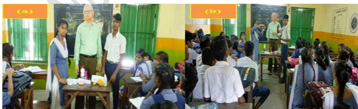
Figure 3: Students in the experimental group learn acids, bases, and salts incorrectly by using metacognitive scaffolding as an instructional strategy to check (a) taste and (b) indicator tests.

Students acquired experiential learning joyfully and efficiently using the detective learning approach by receiving desirable assistance from the teacher (here, the investigator). The role of the teacher during the activities was that of a facilitator and guide, and he created an attractive learning environment in the classroom to ensure quality learning in physical science. Activities were self-performed by the students of the experimental group in the classroom with necessary assistance from the teacher; very few of these have been given in Figure 3.