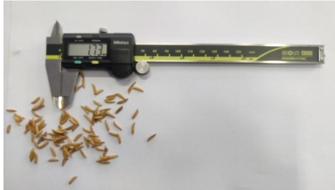
Fig. 2 Vernier Caliper