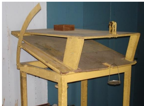
Fig 3 Apparatus for measuring of static coefficient of friction

W = Weight of sample, W_1 = Weight at which empty box just started to slide, W_2 = Weight at which filled box started to slide