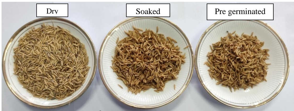
Fig. 1 Dry, Soaked and Pre-germinated seeds of Basmati-370 used for present study

As per DSR sowing techniques, Basmati-370 can be used as dry, soaked (12 hours) and pre-germinated (24 hours soaking and 12 hours incubation) conditions (Fig.1).The experiments to measure the physical and engineering properties were carried out for these forms of seeds in the laboratory. The standard procedure for sampling were adopted and following properties were studied.