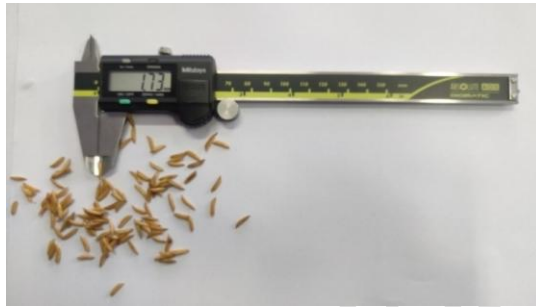
Fig. 2 Vernier Caliper