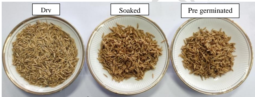
Fig. 1 Dry, Soaked and Pre-germinated seeds of Basmati-370 used for present study

As per DSR sowing techniques, Basmati-370 can be used as dry, soaked (12 hours) and pre-germinated (24 hours soaking and 12 hours incubation) conditions (Fig.1).The experiments to measure the physical and engineering properties were carried out for these forms of seeds in the laboratory. The standard procedure for sampling were adopted and following properties were studied.