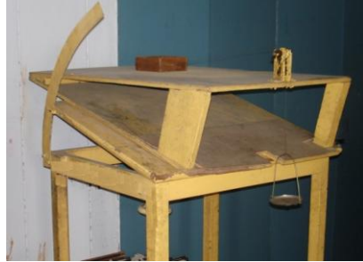
Fig 3 Apparatus for measuring of static coefficient of friction