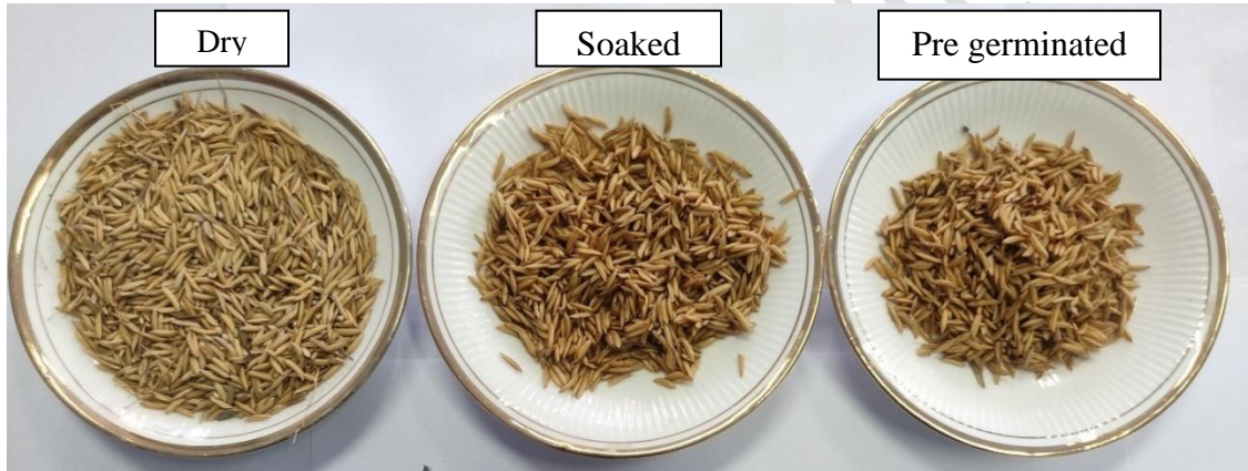
Fig. 1 Dry, Soaked and Pre-germinated seeds of Basmati-370 used for present study

As per DSR sowing techniques, Basmati-370 can be used as dry, soaked (12 hours) and pre-germinated (24 hours soaking and 12 hours incubation) conditions (Fig.1). The experiments to measure the physical and engineering properties were carried out for these forms of seeds in the laboratory. The standard procedure for sampling were adopted and following properties were studied.