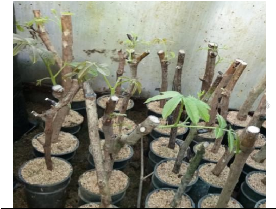
a. Shoot initiation on cuttings under different plant growing media