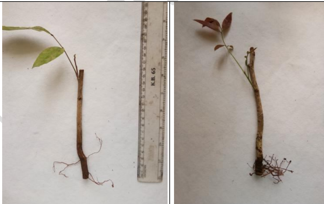
b. Rooting in cuttings of Kusum