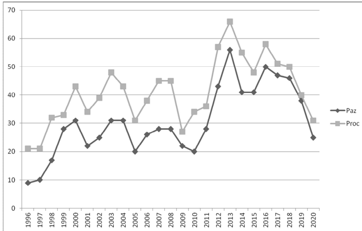
Figure 1: Patients procedures ratio

Figure 1 shows the year-by-year trends in the number of patients undergoing autologous PBSC collection and the number of leukapheresis procedures needed to achieve the collection goal set by colleagues in the clinical unit.