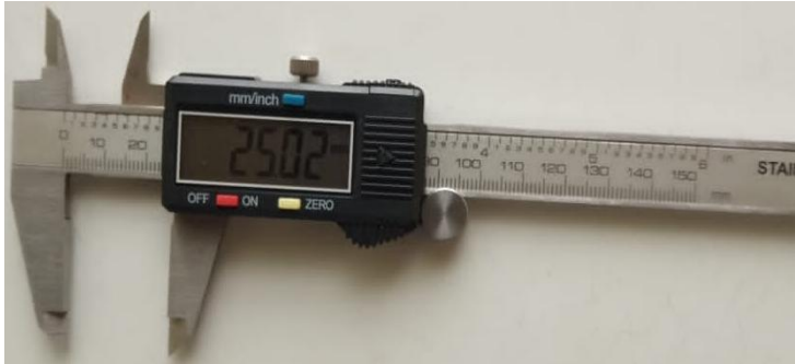
Figure 1: Digital Vernier Caliper

Comment [SM-T29512]: use correct spelling