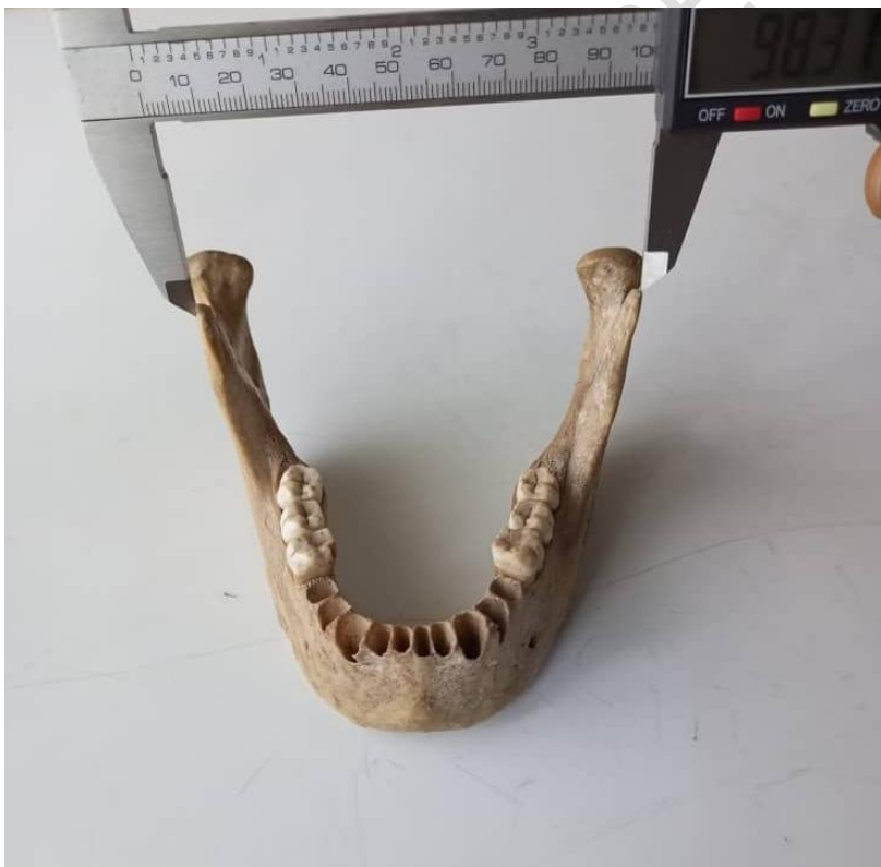
Figure 2: Biconoid breadth measured using digital vernier caliper (mm)

Comment [SM-T29512]: use correct spelling