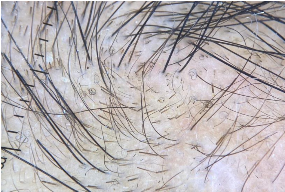
Fig.3 .Pig-tail appearance on trichoscopy.