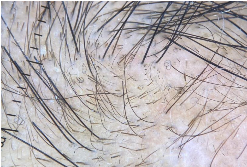
Fig. 3 . Pig-tail appearance on trichoscopy.