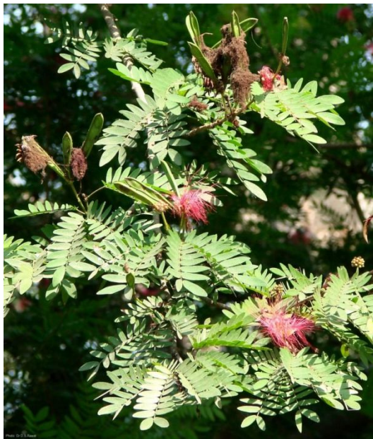
39 40 Fig. 1. Calliandra haematocephala Hassk.

34 Although several macromorphological and pharmacological studies have been conducted on Calliandra haematocephala , 35 detailed information of micromorphological characters like surface indumentum and trichome morphology is not well 36 investigated. Present study was conducted to explore the structural diversity and distribution of trichomes, and vestiture 37 types on the surfaces of all vegetative as well as reproductive parts to fill the void in information regarding 38 micromorphology of Calliandra haematocephala .