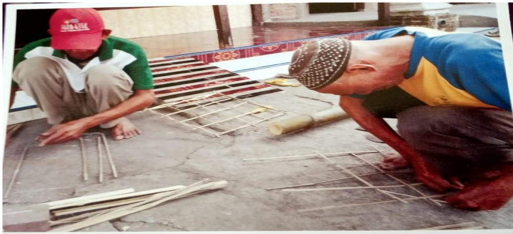
Fig.2. The process of making the ancak