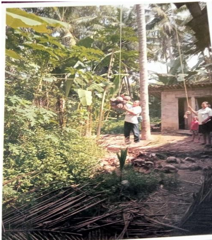
Fig.1. Picking coconuts using a rope.