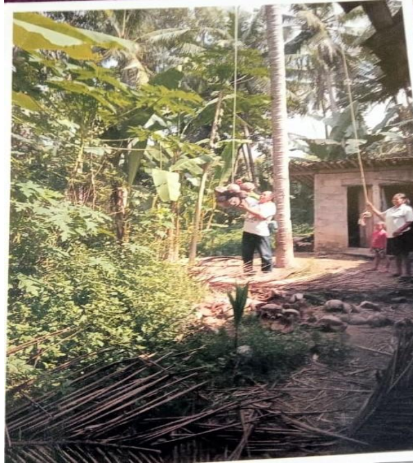
Fig.1. Picking Taking coconuts usinges a rope.