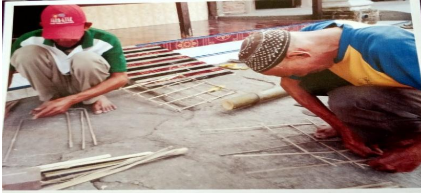
Fig.2. The Making process of making the ancak

which symbolize means the pillars of Islam and the importance of praying five times a day. The random amount each year differs depending on the funds owned by the foundation. For 2022, approximately 340 ancak will be provided.