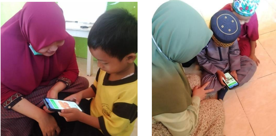
Image 2. Field Trial Activities

The results of the field trials were compared to the pretest and posttest scores in the experimental and control groups. The experimental group received treatment with electronic worksheets based on mobile learning, whereas the control group received treatment with worksheets commonly used in learning activities. Table 8 displays the average pretest and posttest scores of the experimental and control groups based on the results of the trials conducted.