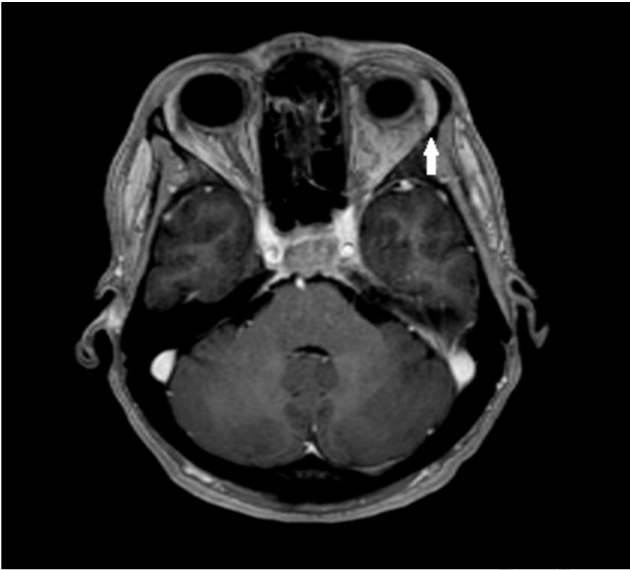
Figure 1: A cerebral CT scan showed a hypodense lesion infiltrating the left orbit in favor of an orbital metastasis (arrow).