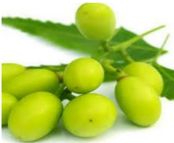
Fig. 1: Azadirachta Indica Seed