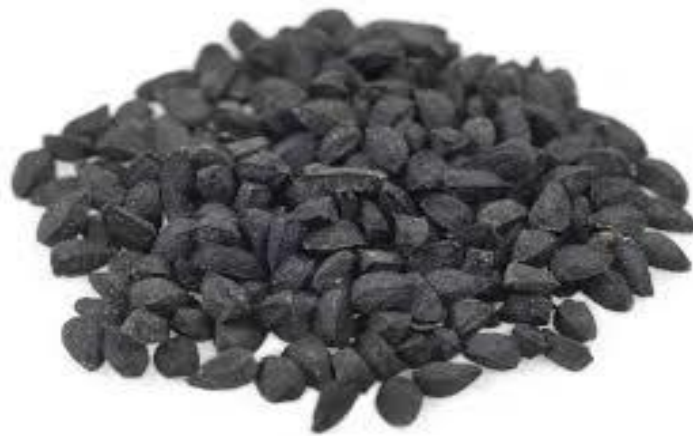
Fig. 2: Nigella Sativa Seed

mice, administered both intraperitoneally and orally. Both treatments showed significant parasitemia suppression, with highest values observed in mice treated with ethanol extracts of 100 and 200 \mu L/kg and Chloroform extracts of 100 \mu L/kg which ( p < 0.05 ) reduced parasitemia and increased survival rate of the mice. In 2018, Ashcroft, et al., tested aqueous and methanolic extracts of N. sativa in Plasmodium berghei infected mice, which revealed parasitemia suppression significantly ( p < 0.05 ) in all groups treated with 25mg/kg, 50mg/kg and 100mg/kg. This result of antimalarial potency of N. sativa paves way for further investigation for a novel plant based antimalarial, as it indicated that higher doses of the extracts do not necessarily cause higher degree of parasitemia suppression.