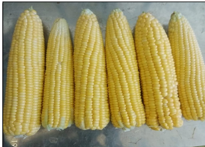
Fig. 2: Cobs without husk