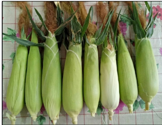
Fig. 1: Cobs with husk

total weight of young cobs with and without husk from each net plot across all pickings was calculated in kilogrammes and expressed as q\ ha^{-1} . After pickings were completed, the green fodder gathered from each net plot was tied in bundles and weighed in kg\ plot^{-1} . The mass was converted to q\ ha^{-1} . The collected husk was also included in the feed yield. The economics of all treatment combinations were calculated using green cob yield, green fodder yield, and the cost of input and output at the time of experimentation.