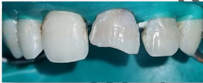
Figure 7- Non vital bleaching in relation to 21

Water-soluble cream (Vaseline) was applied to soft tissues to protect the gingiva, and rubber dam isolation was achieved; subsequently, 2-3 mm of gutta-percha was removed in an apical direction beyond the cemento-enamel junction. 2-3 mm glass ionomer cement foundation was placed over the gutta percha to ensure a barrier between the sealed root canal and the bleaching gel (mechanical seal). Non vital bleaching with 35% hydrogen peroxide gel (Pola office, SDI, Australia) was done. The bleaching agent was expressed into the opened pulp chamber and on the labial surface, and curing light was applied to activate the bleaching gel from the labial and palatal sides. The gel was changed and repeated until desired results were obtained (Fig 7 and 8). Clinical evaluation was recorded by comparing the tooth shade with its original one before treatment using the Vita classic shade guide and photographs 6 .