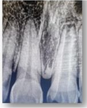
Figure 2: Intra operative radiograph – 11 and 21

In the first session, standard endodontic access was made from the palatal aspect in relation to 21 after the rubber dam isolation (Fig 3). Initial working length was predicted by using paper point method. Then radiograph was made and working length was confirmed (Fig 4). Cleaning and shaping was done with circumferential filing up to #80 K-file. The canal was irrigated with 3% of sodium hypochlorite (Prime Dental Products Pvt. Ltd., Thane, India) and saline. Canal was dried with multiple absorbent points and calcium hydroxide dressing (RC Cal; Prime Dental Products Pvt. Ltd., Thane, India) was placed. Access was sealed with Cavit (3M/ESPE, Seefeld, Germany).and patient was recalled.