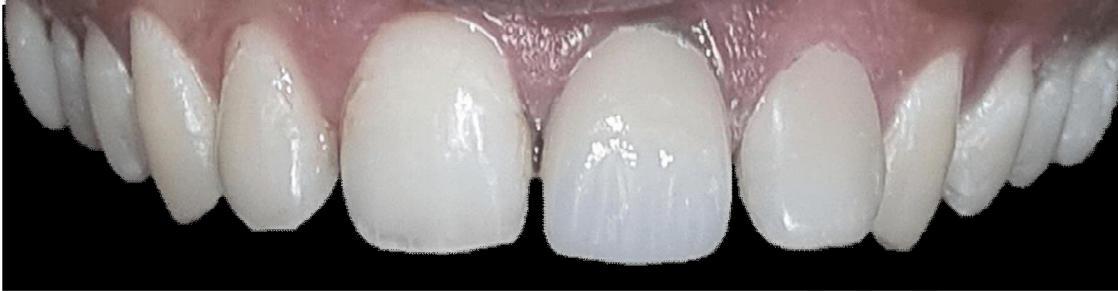
Figure 9 – Fabrication of the E-max crown in 21

E-max crown( Lithium disilicate) was chosen to repair the maxillary anterior tooth to meet the patient's aesthetic and functional needs (Fig 9 ), taking into account the patient's age, career, and interest in and understanding of the newest available restorative material.