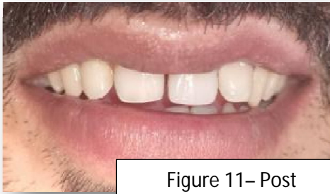
Figure 11– Post operative smile