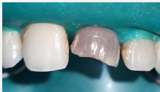
Figure 3- rubber dam isolation

In the first session, standard endodontic access was made from the palatal aspect in relation to 21 after the rubber dam isolation (Fig 3). Initial working length was predicted by using paper point method. Then radiograph was made and working length was confirmed (Fig 4). Cleaning and shaping was done with circumferential filing up to #80 K-file. The canal was irrigated with 3% of sodium hypochlorite (Prime Dental Products Pvt. Ltd., Thane, India) and saline. Canal was dried with multiple absorbent points and calcium hydroxide dressing (RC Cal; Prime Dental Products Pvt. Ltd., Thane, India) was placed. Access was sealed with Cavit (3M/ESPE, Seefeld, Germany).and patient was recalled.