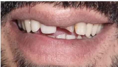
Figure 10- Pre operative smile