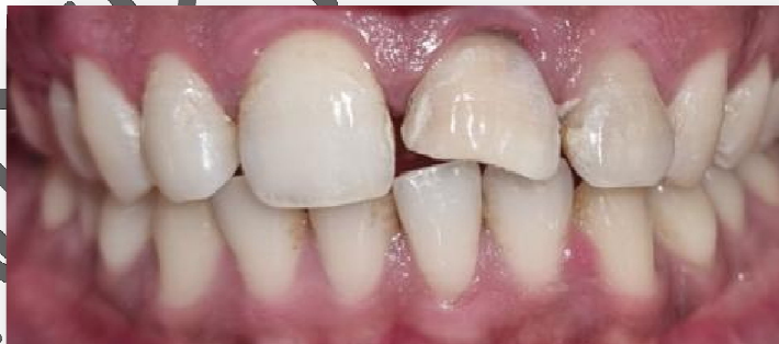
Figure 8 – after bleaching (21)