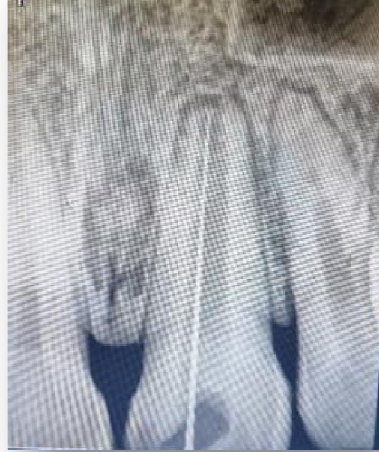
Figure 4 – Working length determination

One week later, tooth was again isolated and canal thoroughly irrigated with saline to remove any remnants of calcium hydroxide. The canal was dried with sterile paper points. Following the drying of the canal, MTA (Dentsply Tulsa Dental, Tulsa, OK, USA) powder was combined with distilled water and then transferred into the canal using an amalgam carrier and packed using hand pluggers to establish an apical plug of about 4 mm, followed by a confirmation radiography (Fig 5). A moistened cotton pellet was applied over the canal orifice and the tooth was temporarily restored. Subsequently, backfill was performed using thermoplasticized gutta-percha (Calamus) in association with AH Plus sealer (Dentsply; Detrey, Konstanz) (Fig 6).