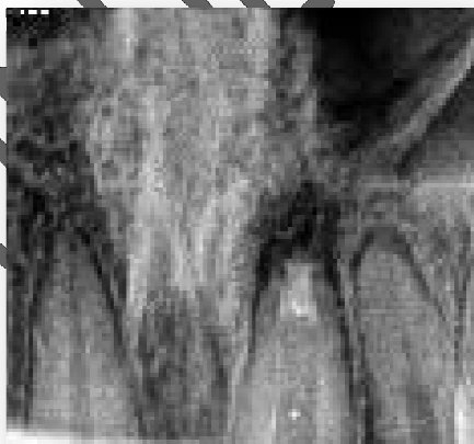
Figure 5 – MTA plug

One week later, tooth was again isolated and canal thoroughly irrigated with saline to remove any remnants of calcium hydroxide. The canal was dried with sterile paper points. Following the drying of the canal, MTA (Dentsply Tulsa Dental, Tulsa, OK, USA) powder was combined with distilled water and then transferred into the canal using an amalgam carrier and packed using hand pluggers to establish an apical plug of about 4 mm, followed by a confirmation radiography (Fig 5). A moistened cotton pellet was applied over the canal orifice and the tooth was temporarily restored. Subsequently, backfill was performed using thermoplasticized gutta-percha (Calamus) in association with AH Plus sealer (Dentsply; Detrey, Konstanz) (Fig 6).