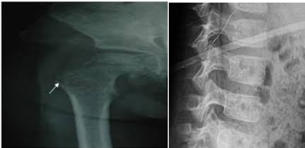
figure 2 : bone demineralisation of the femoral head figure 3 : 5-year-old patient with LLA (standard radiography with compression of L5)

2. Location of bone involvement: Patients who presented with AML with OA (OD, bone pain. The location of bone pain was 53% in the lower limbs with accentuation in the pelvic girdle, 24% in the back and 20% in the upper limbs.