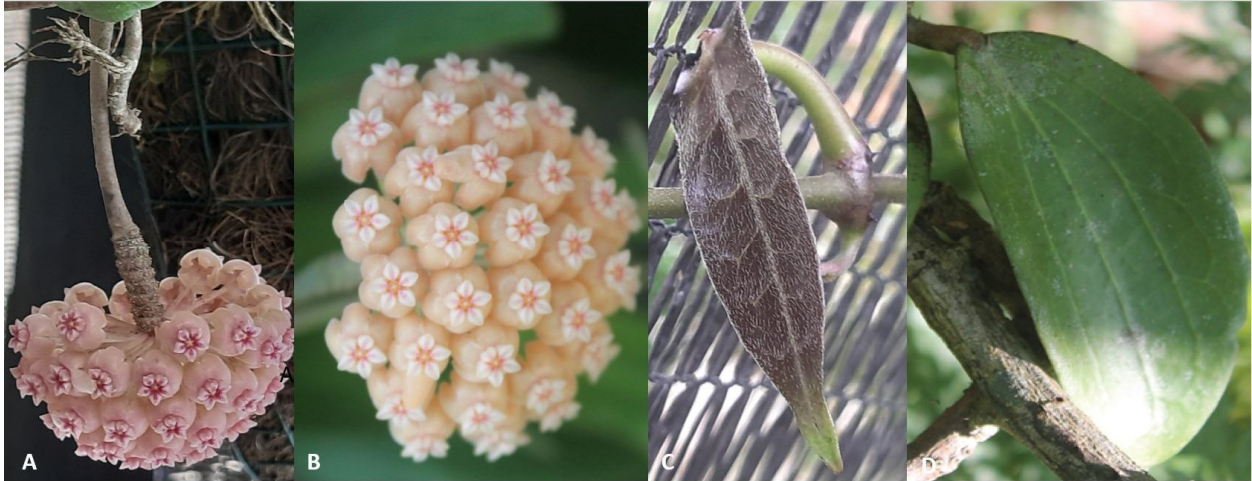
Figure 3. Inflorescence and leaves of Hoya pachyphylla from Ubiyau Village, West Papua (A)

The rings on the peduncle (yellow arrow) indicate the location of the previous inflorescences and that this plant has produced flowers nine times (B) Different shades of flower color from different plants of H. pachyphylla (C) a young leaf (D) a mature leaf