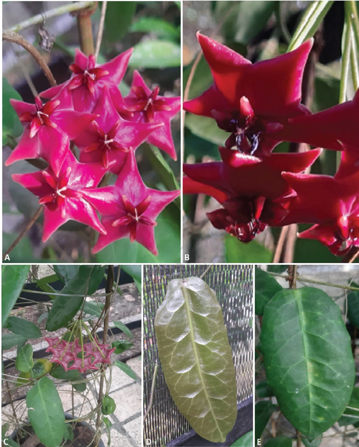
Figure 2. Hoya megalaster collected from Ubiyau forest, West Papua (A) The inflorescence (B) The release of nectar from the flowers in the morning (C) Leaf pairs and inflorescence (D) young leaf (E) mature leaf