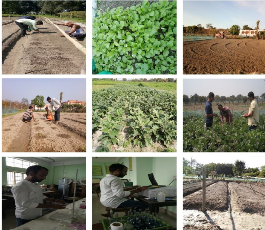
Figure 1: Field preparation, view, data collection and lab analysis during research work

Comment [KKP4]: Picture are silent. Why? Or we don't see what you want to show