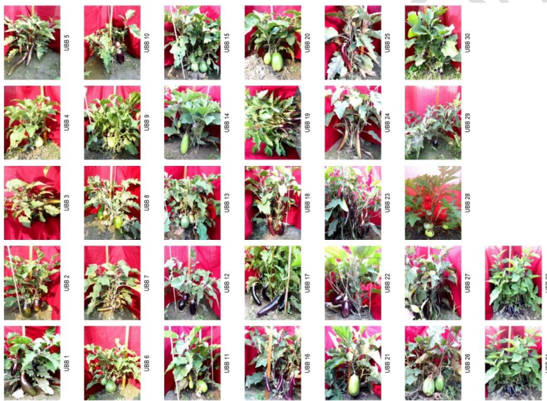
Figure 3: Different types of brinjal genotypes collection

Comment [KKP7]: Put it under the picture