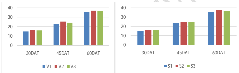
Fig.1 Effect of variety and spacing on plant height 30,45, 60 DAT(days after transplanting)