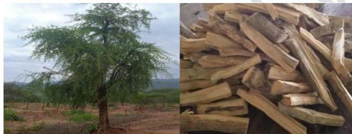
Figure 2: Balanites aegyptiaca plant and harvested roots

Cultivation and naturalization conceal natural distribution. It is said to be native to all arid regions south of the Sahara, stretching as far south as Malawi in the Rift Valley and the Arabian Peninsula. Latin America and India are where it was first domesticated. Although it has a broad biological range, it is mostly found on flat alluvial soils with deep sand loam and unrestricted access to water. It is shade-intolerant after the seedling stage and favors open woodland or savannah for natural regeneration. It is a lowland species that may reach an elevation of 1000 m in regions with average annual temperatures of 20 to 30 °C and average annual rainfall of 250 to 400 mm[4].