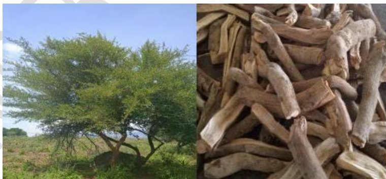
Figure 1: Combretum hereroense plant and harvested roots

The family Combretaceae, which has 18 genera and includes Combretum , the biggest genus, with roughly 370 species, includes Combretum hereroense , also known as the mouse-eared Combretum or Russet bush willow.[9]. A little tree between 9 and 12 meters tall with a thick crown, Combretum hereroense is a deciduous shrub with sometimes arching stems. It yields reddish-brown, 20 millimeter-diameter, 4-winged samara fruits with thick skin.[25]. In Southern and Eastern Africa, including Ethiopia, Somalia, Kenya, and Uganda, C. hereroense trees are most frequently found around pans, in rocky terrain, and occasionally on stream banks. Southern Africa includes Tanzania, Angola, Zambia, Malawi, Mozambique, Namibia, Botswana, and Zimbabwe. Numerous studies have shown that antioxidant chemicals found in plants have anti-inflammatory, antimutagenic, antiatherosclerotic, anticancer, anticarcinogenic, antibacterial, and antiviral properties[Schueler and Hemp]. See Figure 1 below.