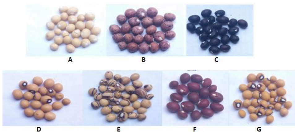
Figure 1 : Different colour of Bambara groundnut seeds

Légend : A : Cream, B : Dark brown dots on light red background, C : Black, D : Dark brown rhombic spots on a cream background on the micro pilar tip, E : Brown streaks on cream background, F : Purple, G : Cream with triangular dark eye