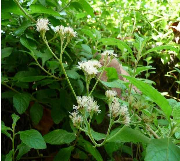
Fig 1. Flowers, fruits, and leaves of J. zeylanica [33]

Jeffreyia zeylanica is endemic to Sri Lanka and shows a native distribution in the dry-wet zone. Common in Chena cultivation and home gardens in the dry zone. It can be seen in Madawacchiya; Wawnia district, Trincomalee district, Hanthana in Kandy district, Peradeniya, Kurunegala district, Wilpatthu National Park, Patangala, Maussakalee in Mathalee district [31]. Due to recent road development projects, this plant has been removed considering it is a weed showing a high growth rate. The National Red List of Sri Lanka is the record that has information about the conservation status of the fauna and flora in Sri Lanka. According to this record, Jeffreyia zeylanica is listed as LC (Least Concerned) [37].