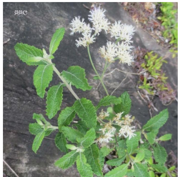
Figure 4. J. zeylanica whole plant [38]