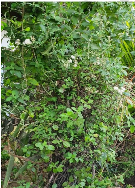
Figure 3. Photograph of J. zeylanica whole plant