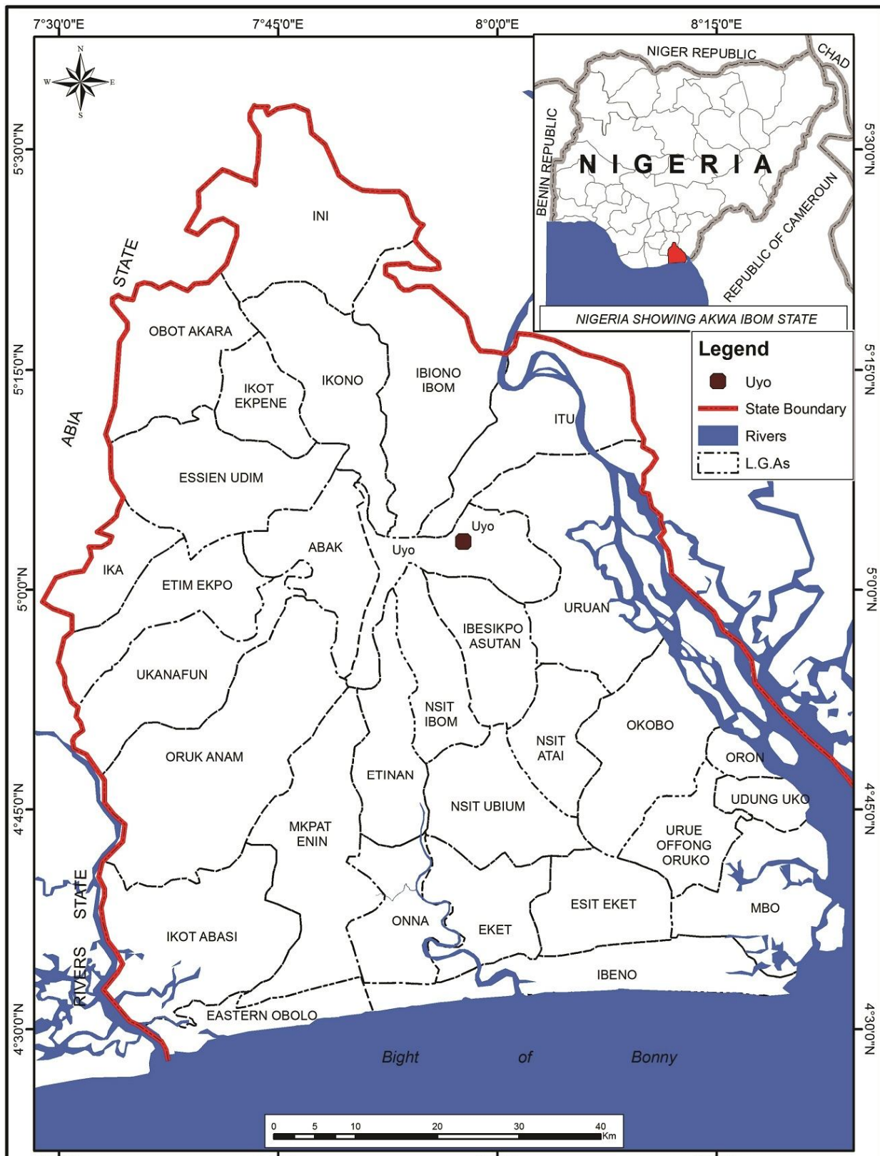
Figure 2: Map of Akwa Ibom State indicating the city in which study location is found