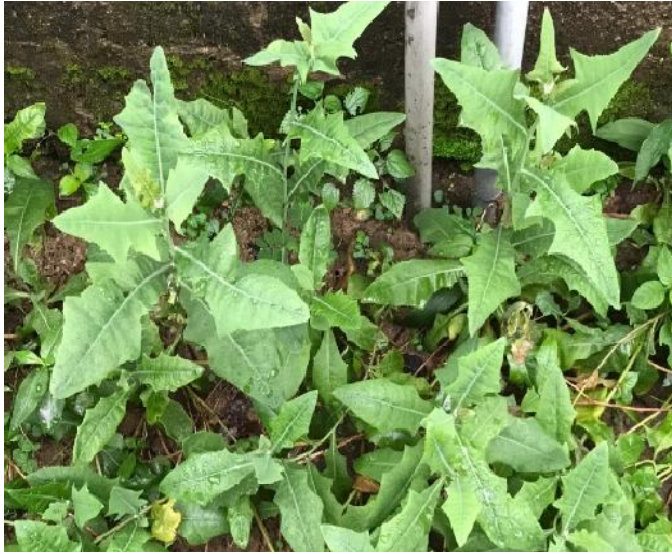
Figure 1: Taraxacum officinale in its natural habitat.