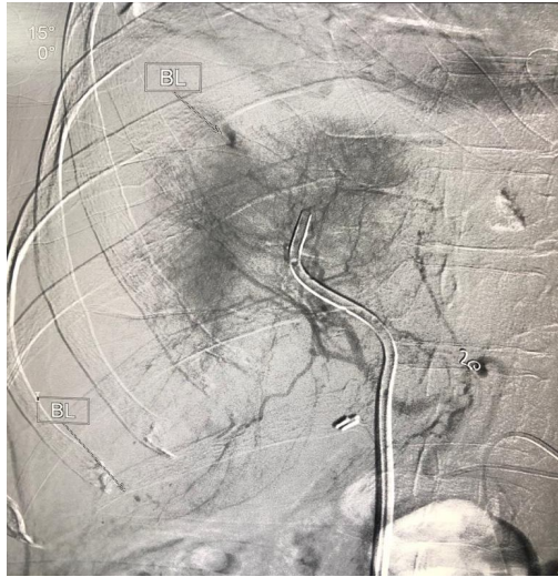
FIG 2 A

Fig 2: Late angiographic phase of a digital subtraction angiogram from the hepatic artery confirms the sub capsular active bleeding from the sub segmental arteries (arrows). These were subsequently embolized.