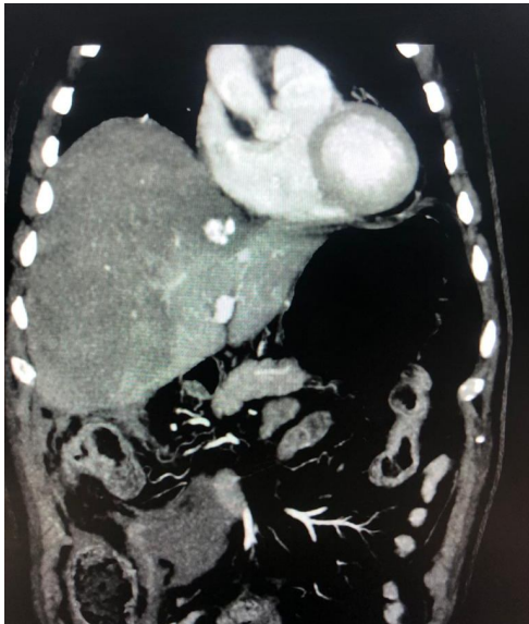
FIG 1 B

Fig 1: Coronal CT reformat of an arterial phase acquisition of the abdomen.. This shows a hypodense hematoma confined within the liver capsule and compressing the normal liver parenchyma. Active arterial bleeding is noted as a dense blush in segment 4 (A) and segments 8 and 6 (Fig 1B)