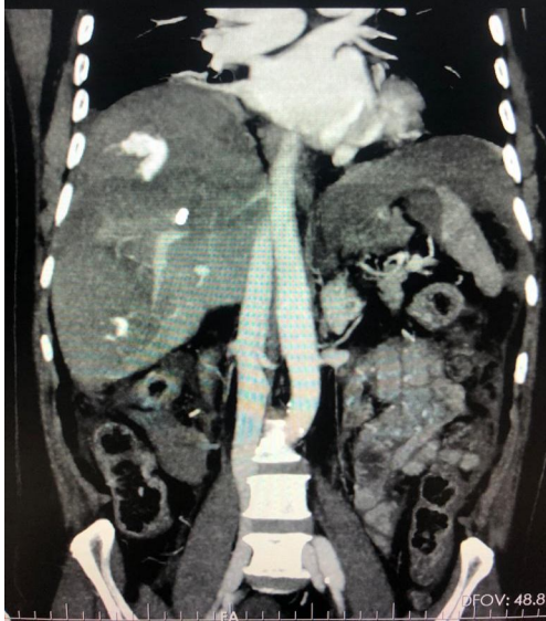
FIG 1 A----