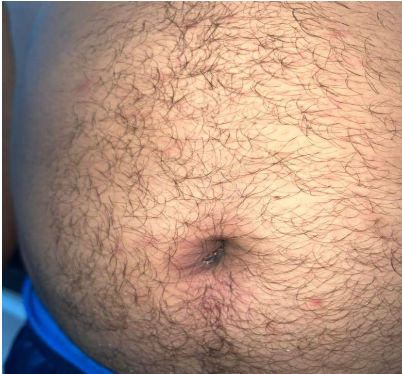
Figure 2 Picture showing eschar on umbilicus – pathognomonic of scrub typhus.