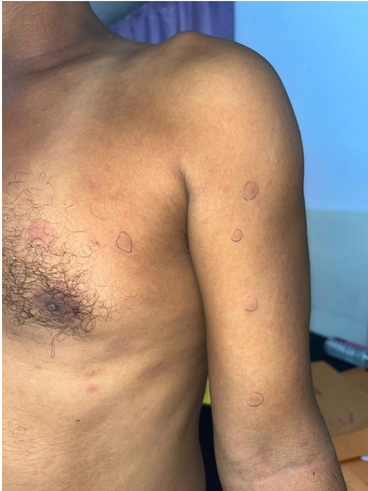
Figure 1 Picture showing rashes in patient of scrub typhus.