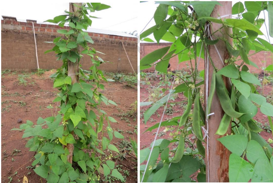
Figure 1. Photos showing two P. lunatus plants wrapped in support (left: flowering plant; right: fruiting plant)

Mounds were made in rows, 9 mounds per row and 11 rows in total. The spacing between two consecutive mounds is 2 m. Seeds were sown on June 13, 2021. The three accessions of the same taxon are sown consecutively. Each row of mounds therefore bears 3 different taxa. The field was regularly weeded and the seedlings were all supported as recommended by [13] as they are lianas (Figure 1).