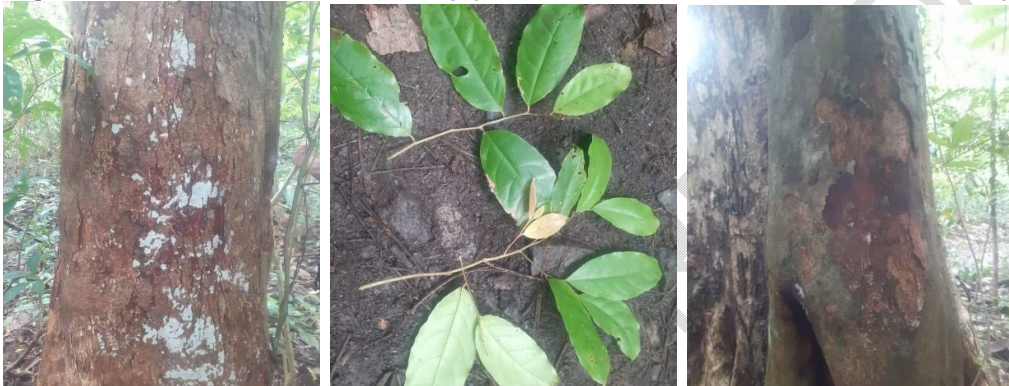
Fig. 4. Homalium celebicum Koord. (Endemic flora in BNTP area, North Sulawesi)

The results showed that in the BNTP area there were two endemic flora species of North Sulawesi, namely the species Homalium celebicum Koord. and Pterospermum celebicum Miq. (Fig. 3 and Fig. 4.). Based on the morphological shape of the stems and leaves of these two endemic flora species, it provides a very interesting visual attraction for tourists visiting BNTP. The uniqueness of these two endemic flora species can be a symbols of conservation and have a high selling value for North Sulawesi. Both species are found at the level of mature trees and sapling. The diversity of both flora species is a special morphology attraction for tourist destinations [15, 16, 17]. This endemic species is also found in the entrance corridor of BNTP. Species Homalium celebicum Koord. and Pterospermum celebicum Miq. has the potential to be an icon or flagship of ecotourism in BNTP area North Sulawesi, Indonesia.