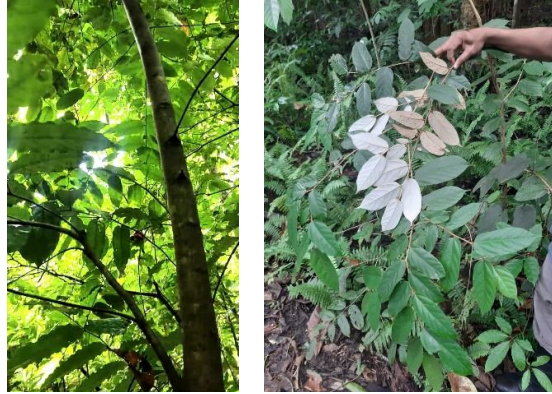
Fig. 3. Pterospermum celebicum Miq. (Endemic flora in BNTP area, North Sulawesi)