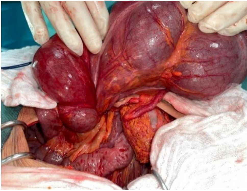
Figure 3 : After operative view showing