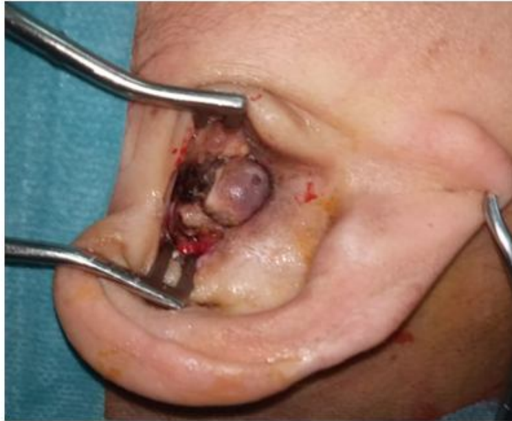
figure1 : IMAGE OF A WELL-LIMITED ROUNDED MASS FILL-UP THE ENTIRE EXTERNAL AUDITORY CANAL

progressively evolving in size for 5 years, of incidental discovery associated with otalgia, tinnitus and persistent progressive hypoacusis, the clinical examination found a rounded and superinfected budding mass filling the entire external auditory canal the rest of the examination was unremarkable, in particular no facial paralysis no retro-auricular infiltration of the concha and pinna the ear, the ganglionic areas were free, forwards and downwards, no signs of extension to the temporo-mandibular joint (TMJ) or to the contents of the parotid compartment, nor to the skin of the cervico-parotid region.