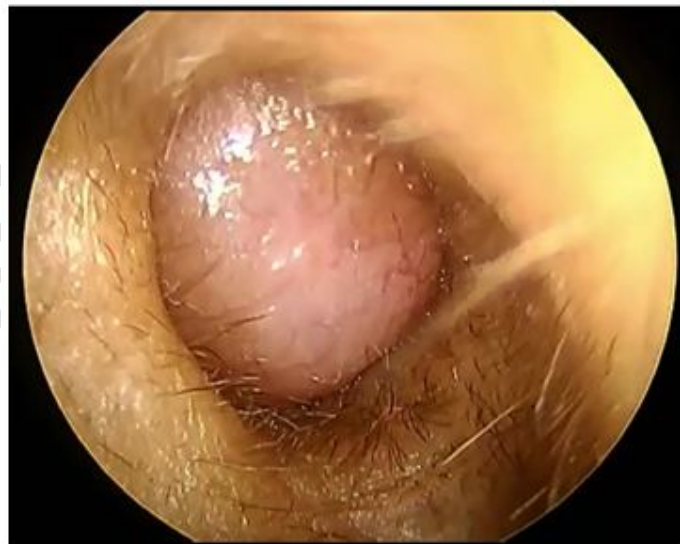
figure2 : OTOSCOPY OF THE RIGHT EAR ROUND MASS FILL-UP THE ENTIRE EXTERNAL AUDITORY CANAL

A rocks scan (coronal and axial cuts) was requested showing hypodensity and the presence of a tissue mass of the right external auditory canal with a well-limited tissue density coming into contact with the tympanic membrane without extension to the middle ear or bone lysis, not taking the contrast and measuring 20*12 mm.