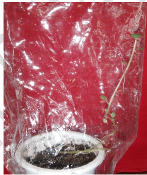
Plate-3: Pot culture of plantlet