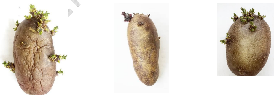
Plate-1: Potato tuber with sprout