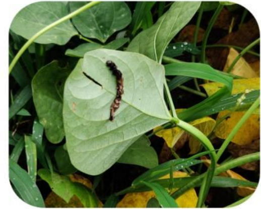
3. Cadaver exhibiting S/NPV infection