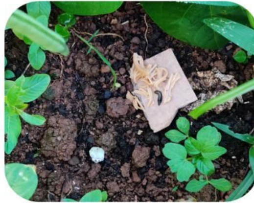
2. Bait feeding