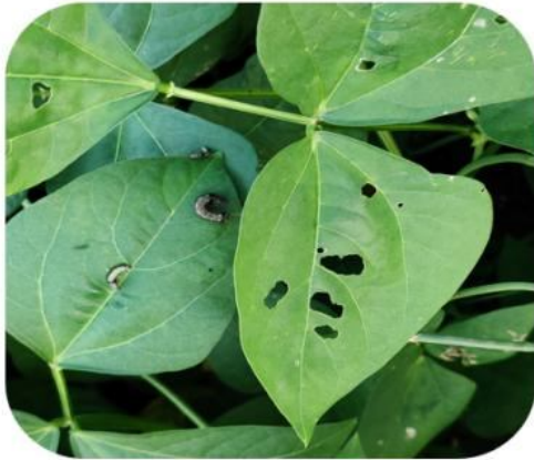
1. Leaf damage due to S. litura