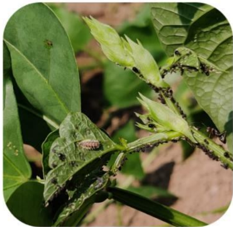
1. Grubs and adults of Coccinella spp.