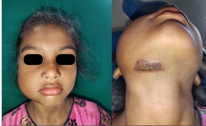
Figure 1: Extra-oral image showing swelling on right side of face and red nodule with draining sinus in right submandibular region.