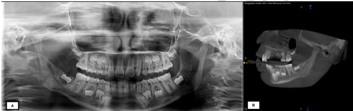
Figure 2: Orthopantomogram(A) and CBCT sagittal view showing bone resorption involving the right coronoid process.