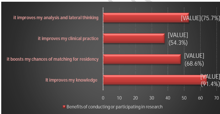
Figure 2: Distribution patterns of the attitude of respondents toward research

It was revealed that 67.1% of the study population demonstrated a good knowledge of research, with 28.6% of the study population having an average knowledge of research and only 4.3% of the study population having poor knowledge of research (Fig. 1).