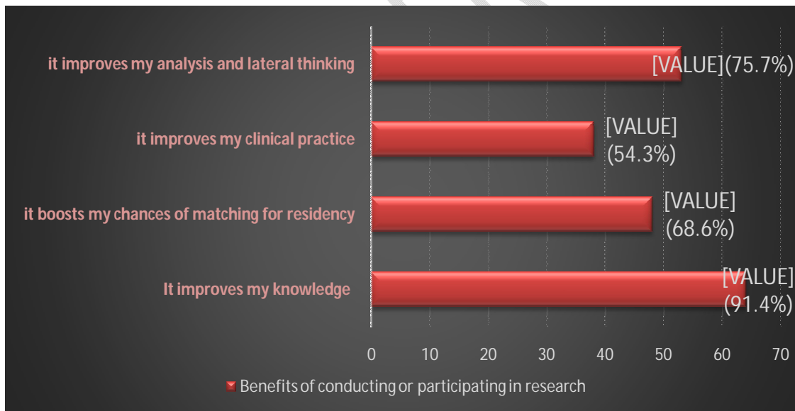
Figure 2: Distribution patterns of the attitude of respondents toward research

It was revealed that 67.1% of the study population demonstrated a good knowledge of research, with 28.6% of the study population having an average knowledge of research and only 4.3% of the study population having poor knowledge of research (Fig. 1).