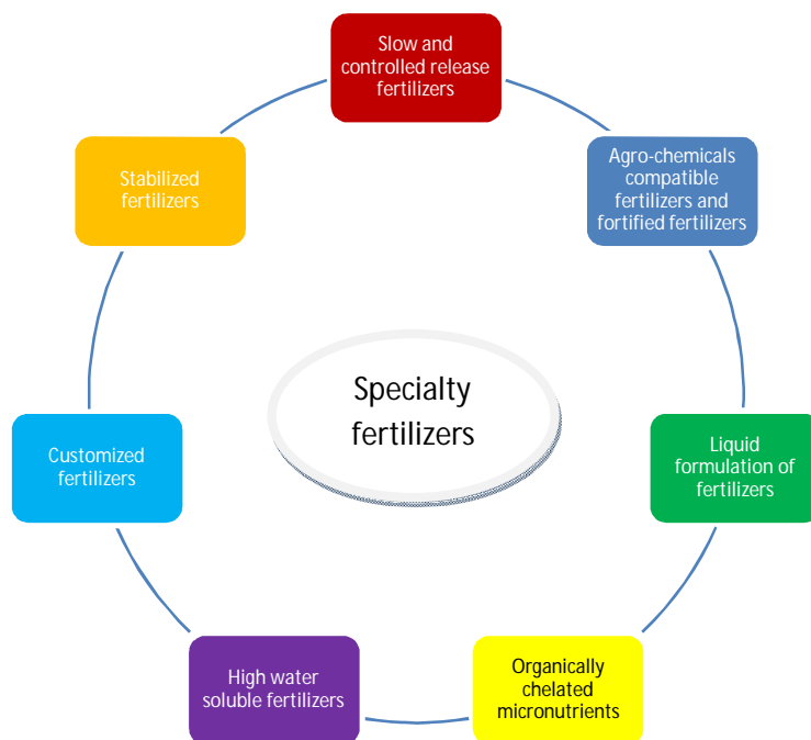
Fig. 1. Specialty fertilizers [7]