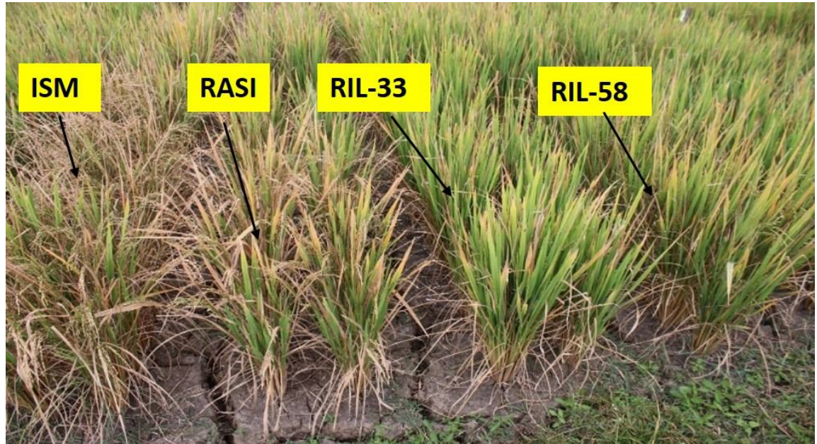
Figure-2: Performance evaluation of selected RILs under drought stress

Performance of the selected RILs (RIL- 33 and RIL-58) along with the parents- Rasi and ISM under drought stress