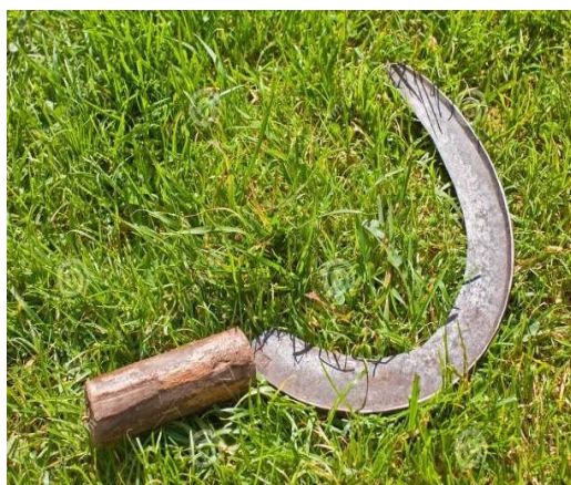
Fig. 2: Manual harvesting with sickle