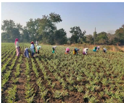
Fig. 1: Manual hand plucking