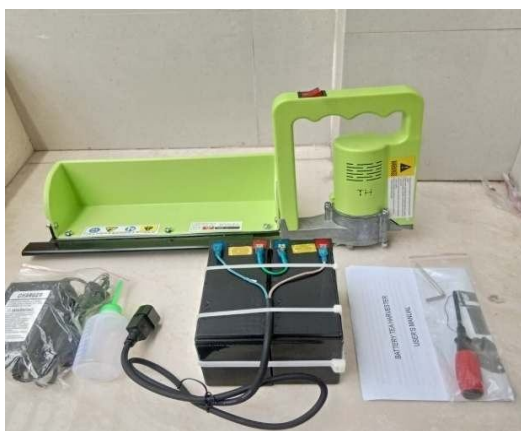
Fig. 3: Battery operated leafy harvester