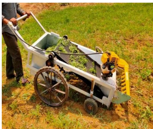
Fig. 4: Manual push type engine operated leafy crop harvester