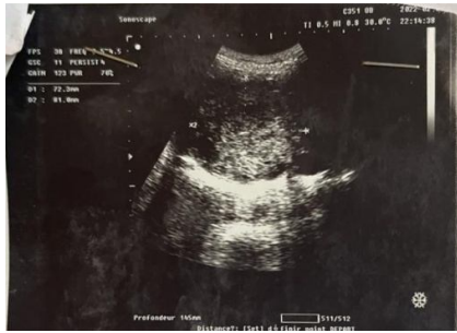
Figure 1: ultrasound image of the praevia mass