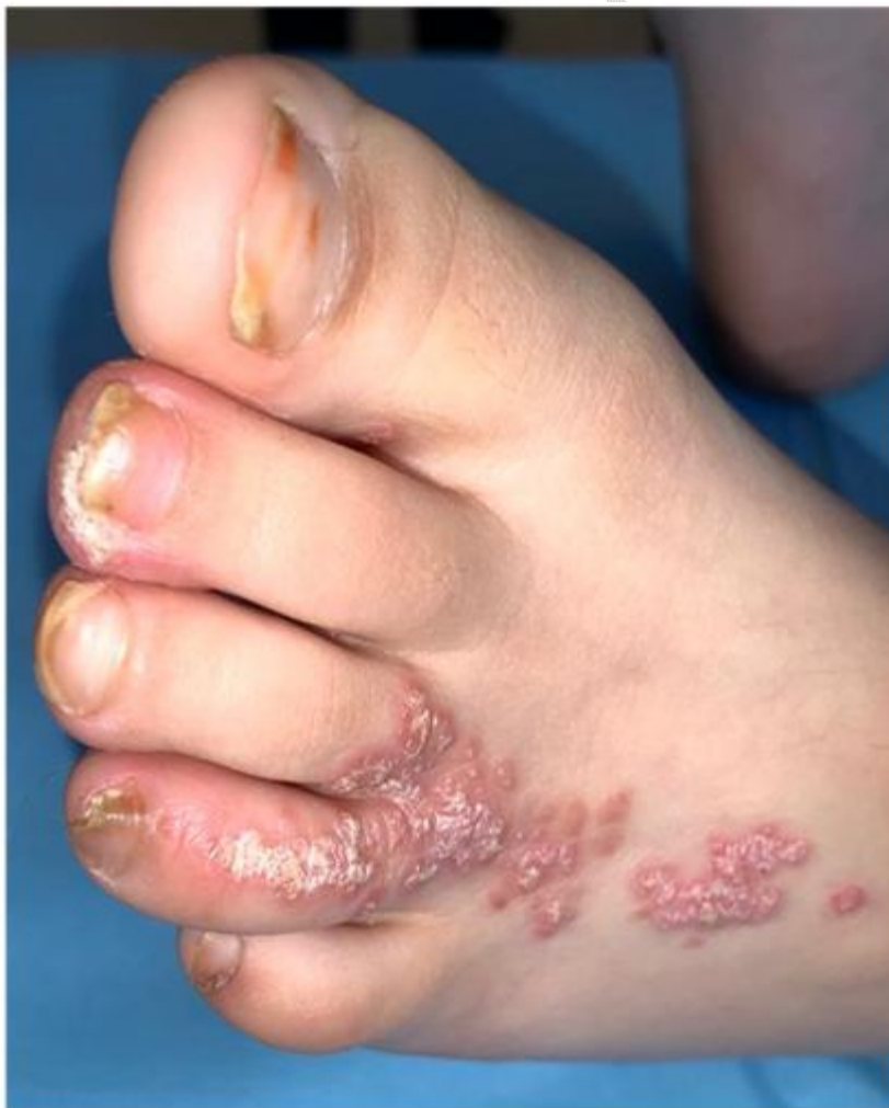
- Figure 1b: Linear psoriasis is present on the third and fourth toes, as well as the sole of the left foot