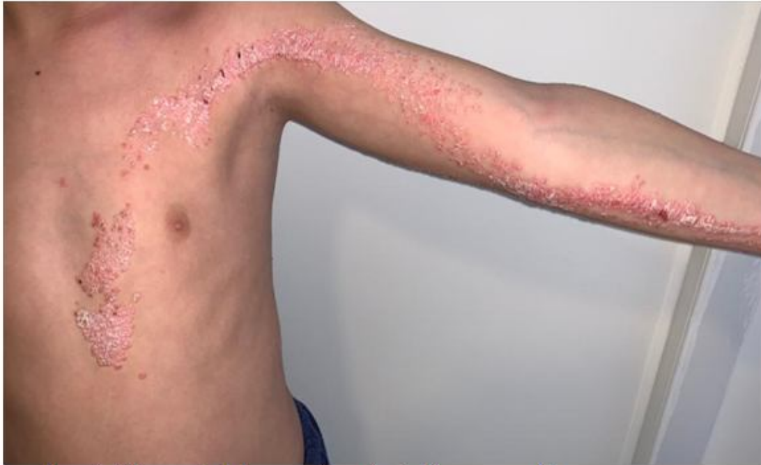
- Figure 1a: Linear psoriasis is seen on the trunk, shoulders, arms, and forearms