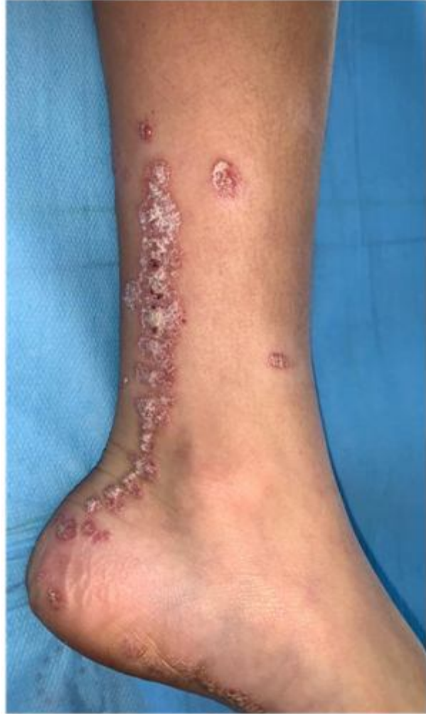
- Figure 1c: The leg displays linear psoriasis