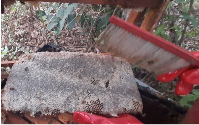
Plate 1: Ripe honey comb