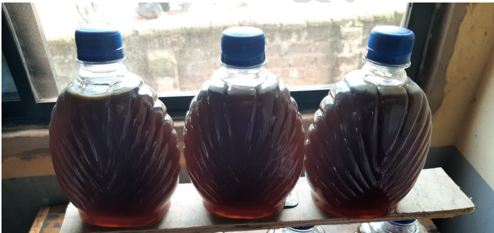
Plate 2: Honey harvested