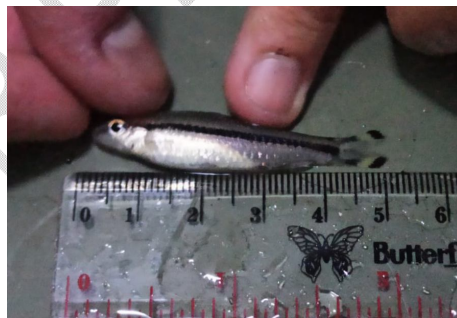
Fig -2: Denison fingerling

Aquariums with dimensions 40x40x50 cm are used in this research as many as 15 pieces. The aquarium preparation stage begins with washing the aquarium, installation of aeration, reservoir containers, and other supporting tools using running water, after that they are soaked with 30 ppm chlorine and the installation is operated for 24 hours, then rinsed with water so that there is no chlorine substance that can later be removed. Water for each treatment (5 treatments) was prepared in each reservoir according to the composition of the treatment, and 25 liters of water were also added to each aquarium according to the treatment. The aquarium that has been filled with water is then aerated with uniform strength in each aquarium. The thing that was done after the preparation of the rearing container was the acclimatization fish test. The test fish used were Denison fingerlings measuring 2-2.5 cm. The newly arrived fish are adapted to the environmental temperature by immersing a plastic bag in fish reservoir water. Furthermore, the reservoir water is slowly inserted into the plastic to adjust the water parameters in the bag, with the reservoir water parameters. The fish are then removed along with the water slowly.