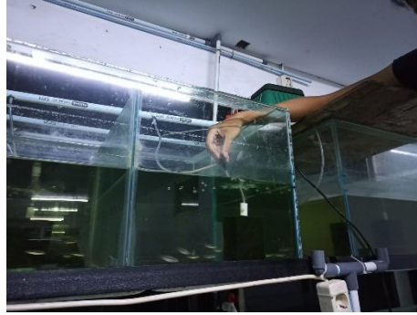
Fig -1: Research Installation

Aquariums with dimensions 40x40x50 cm are used in this research as many as 15 pieces. The aquarium preparation stage begins with washing the aquarium, installation of aeration, reservoir containers, and other supporting tools using running water, after that they are soaked with 30 ppm chlorine and the installation is operated for 24 hours, then rinsed with water so that there is no chlorine substance that can later be removed. Water for each treatment (5 treatments) was prepared in each reservoir according to the composition of the treatment, and 25 liters of water were also added to each aquarium according to the treatment. The aquarium that has been filled with water is then aerated with uniform strength in each aquarium. The thing that was done after the preparation of the rearing container was the acclimatization fish test. The test fish used were Denison fingerlings measuring 2-2.5 cm. The newly arrived fish are adapted to the environmental temperature by immersing a plastic bag in fish reservoir water. Furthermore, the reservoir water is slowly inserted into the plastic to adjust the water parameters in the bag, with the reservoir water parameters. The fish are then removed along with the water slowly.