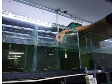
Fig -1: Research Installation

Aquariums with dimensions 40x40x50 cm are used in this research as many as 15 pieces. The aquarium preparation stage begins with washing the aquarium, installation of aeration, reservoir containers, and other supporting tools using running water, after that they are soaked with 30 ppm chlorine and the installation is operated for 24 hours, then rinsed with water so that there is no chlorine substance that can later be removed. Water for each treatment (5 treatments) was prepared in each reservoir according to the composition of the treatment, and 25 liters of water were also added to each aquarium according to the treatment. The aquarium that has been filled with water is then aerated with uniform strength in each aquarium. The thing that was done after the preparation of the rearing container was the acclimatization fish test. The test fish used were Denison fingerlings measuring 2-2.5 cm. The newly arrived fish are adapted to the environmental temperature by immersing a plastic bag in fish reservoir water. Furthermore, the reservoir water is slowly inserted into the plastic to adjust the water parameters in the bag, with the reservoir water parameters. The fish are then removed along with the water slowly.