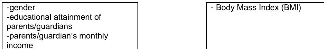
Fig. 1. Conceptual Framework of the study showing the relationship between the variables

The conceptual framework presented the dependent and independent variables of the study. The nutritional status of children ages 0-5 years old was represented by their anthropometric measurements (WAZ, HAZ, and BMI) and was classified as a dependent variable since those were assumed to be affected by the independent variable, which was the socio-demographic profiles of parents/guardians.