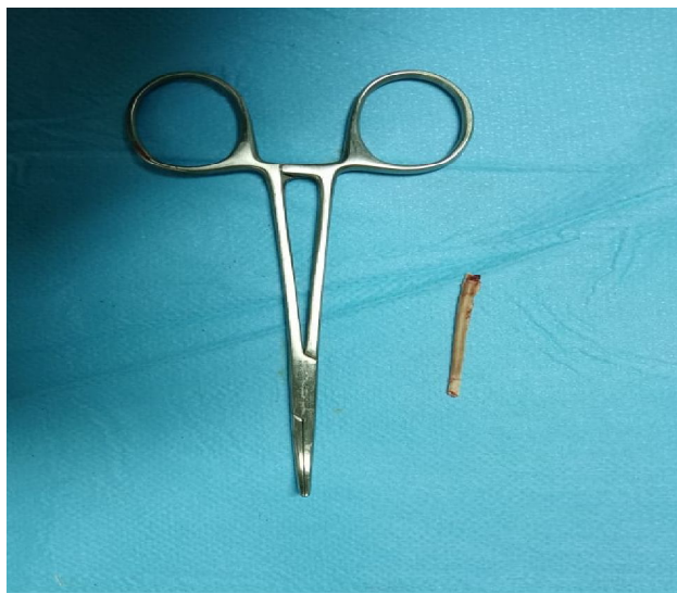
Fig. 3. The IUD after removing