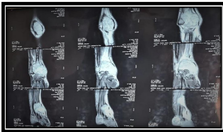
FIG 3: The MRI showing the extension of the tumor to the soft tissue of the wrist