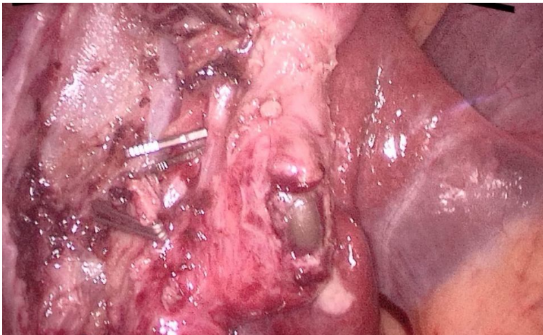
Figure 3: Intraoperative photograph showing the removal of the stent through the gallbladder