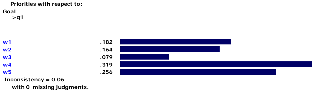
Figure 2 - Prioritize factors related to market approach that influence creative marketing