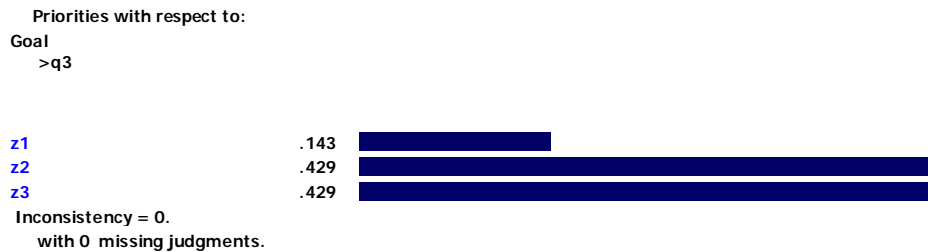
Figure 3 - Prioritize factors related to communication channels that influence creative marketing

In Table 3, you can see that the introduction of services in communication channels and the reception of a suitable communication channel for the distribution of services with a coefficient of 0.429 has the highest value and knowledge and the use of communication channels with a coefficient of 0.143 has the lowest value.