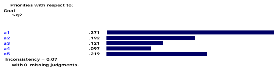
Figure 4 - Prioritize service delivery factors that influence creative marketing

In Table 4, you can see that providing creative designs for services with a coefficient of 0.371 has the highest value and providing appropriate learning opportunities for customers with a coefficient of 0.097 has the lowest coefficient.